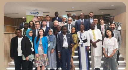
OAFRESS Champions at the Gavi 5.0 Consultation, August 2019, Geneva, Switzerland.