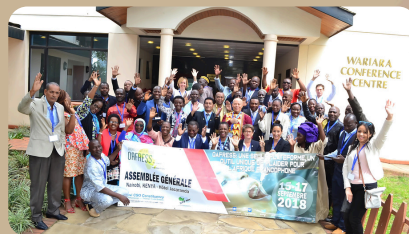
OAFRESS First Constitutive General Assembly, Nairobi, Kenya, 2018.