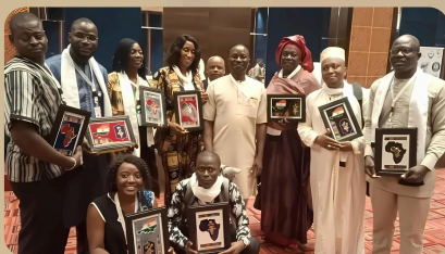
A group of OAFRESS Champions at 'Connexion 2022' in Niamey proudly display their certificates of recognition.