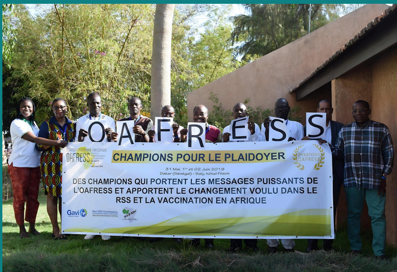
Launch of the OAFRESS Champions program and training of the first cohort in Saly, Senegal, June 2019.