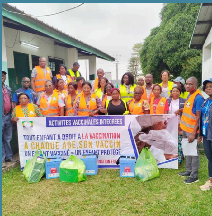
Integrated vaccination activities in Mouila, Central-South Ngounie, Gabon, July 2023, by the Expanded Program on Immunization and partners.

Africa sees a resurgence of vaccine-preventable diseases, with measles leading in Gabon.