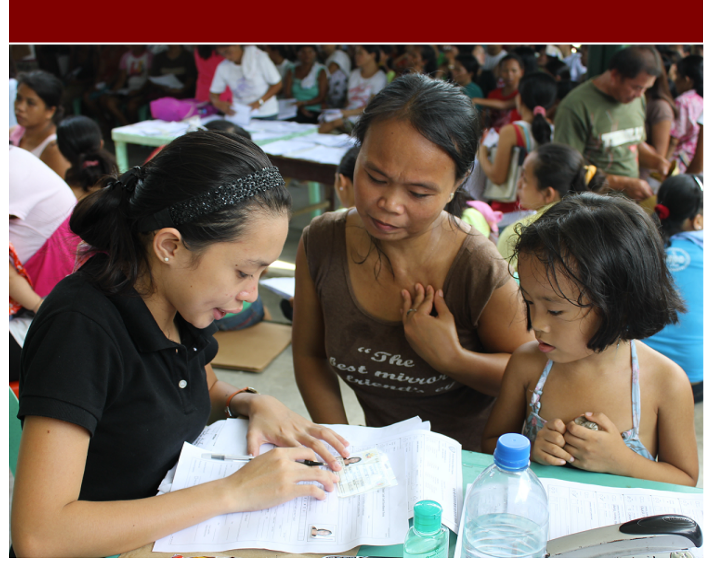
IMAGE BY PHILIPPINES DEPARTMENT OF SOCIAL WELFARE AND DEVELOPMENT (DSWD)